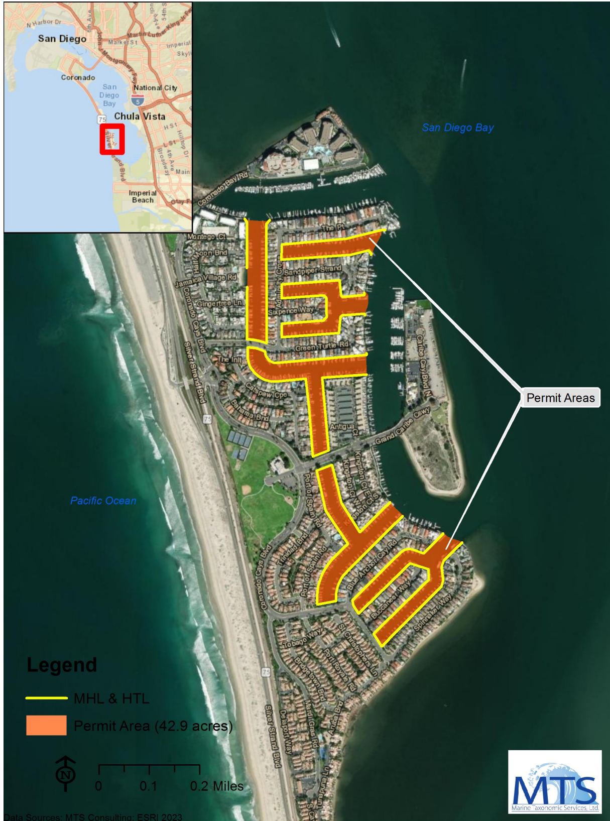
Figure 1. Vicinity map of the CCHOA water area and area proposed for an RGP for dock replacement projects in Coronado, California. Inset shows San Diego Bay. Image north aligned.